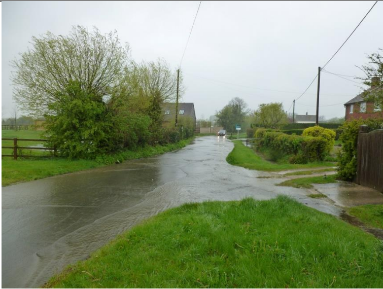
Woolstone Rd west from Shotover corner