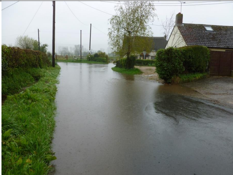
Woolstone Rd opposite Manor Cottage