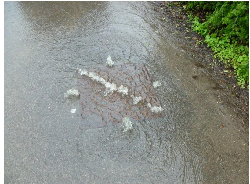
Woolstone Road outside Manor Cottage