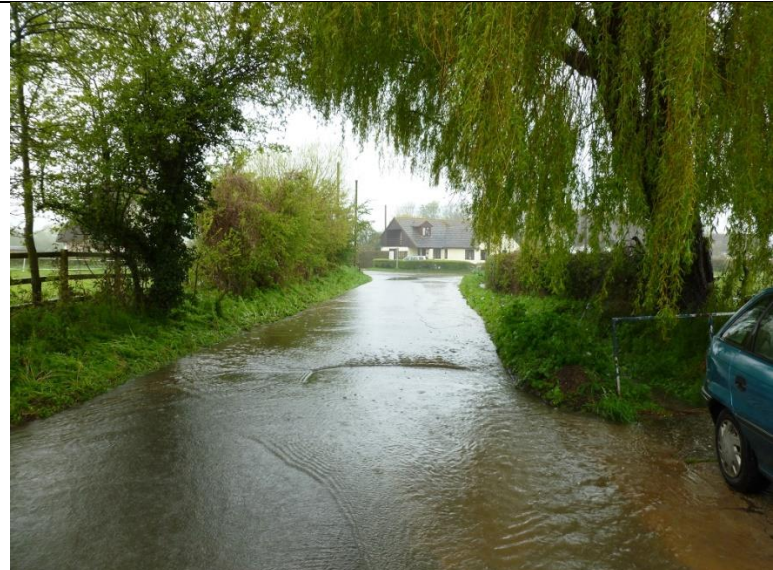
Woolstone Rd outside Creslu