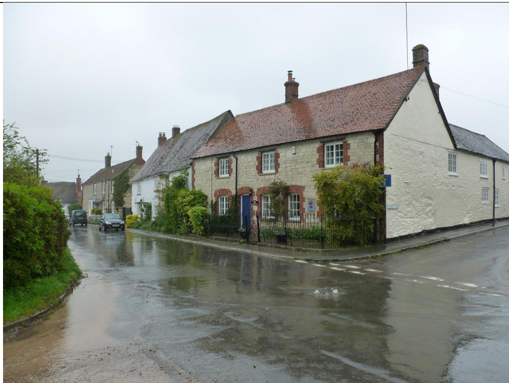
High St opposite Baker's Arms