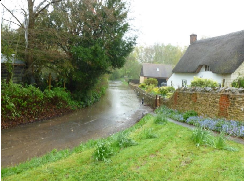
Fernham Road outside Rose Cottage