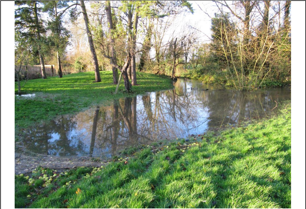
The Manor garden