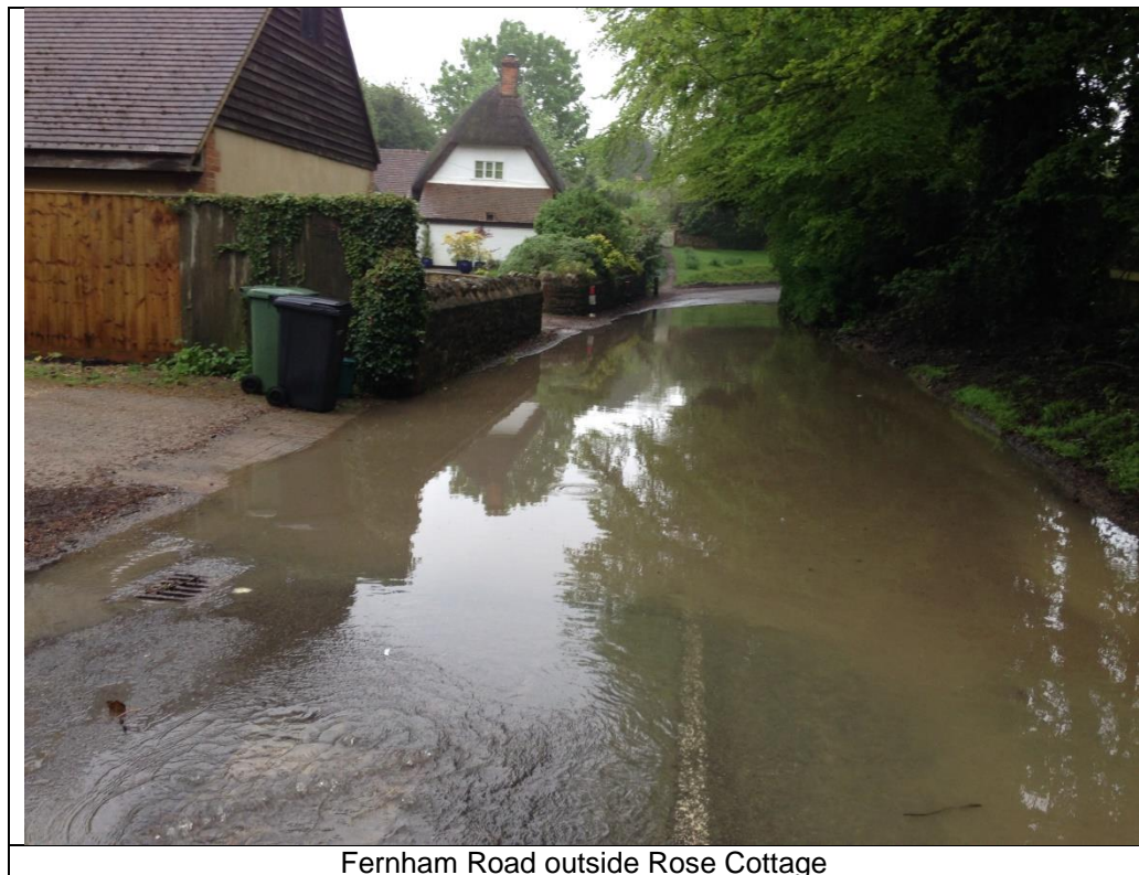
Fernham Road outside Rose Cottage