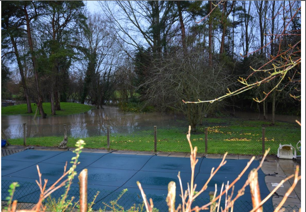
The Manor garden