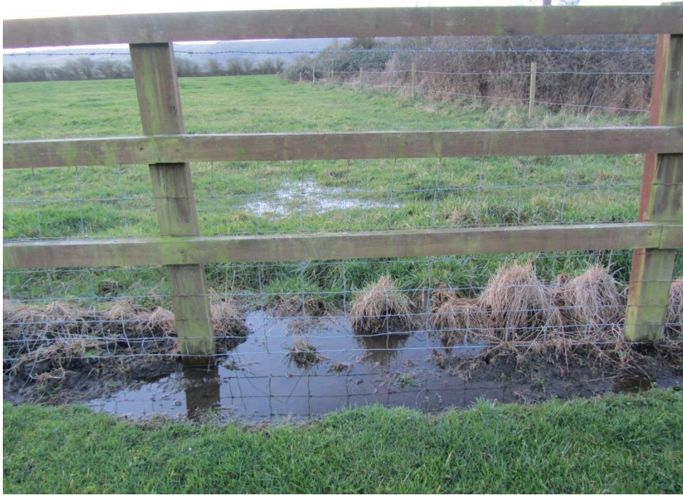
Field behind Hookside

Routinely, the lower lying sections of Upper Common Lane back gardens, and the stream in the lane itself, flood in heavy rain as does the land immediately adjacent to the garden, which becomes a marsh/lake.