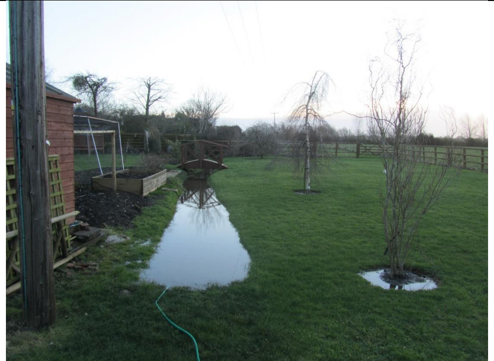
Hookside back garden