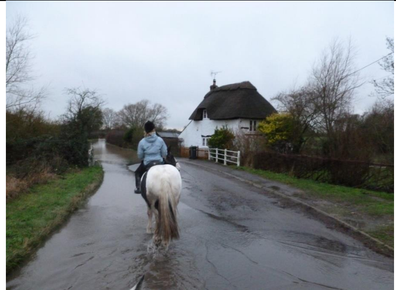
Woolstone Road near Bridge Cottage