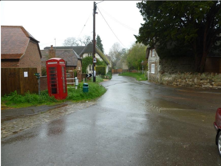
Broad Street opposite Church