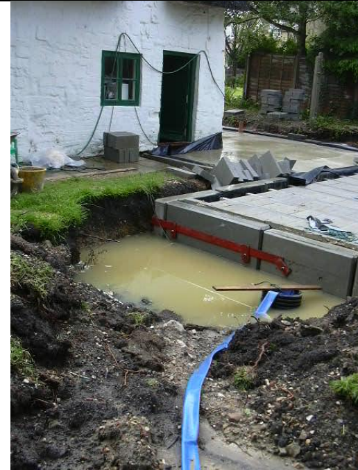
Pumping out site

Brockwood has never flooded though in a particularly heavy storm flood water approached the front garden and drive from Upper Common Lane ditch.