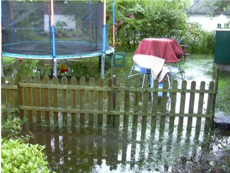
Cottage on the Green