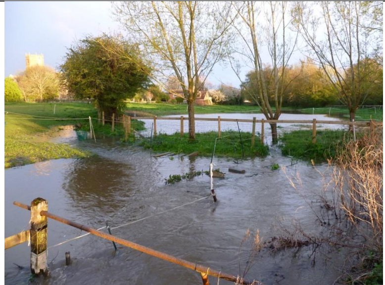
Fernham Road near Allotments