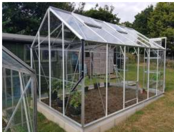
The new greenhouse

We had two main aims for the project: the toughened glass greenhouse will give a safer working and learning environment, especially for children, and will allow us to build on the strong links that we have already established with local children's groups, and the Primary School. Having another large water tank will make the garden much more resilient to summer water shortages.