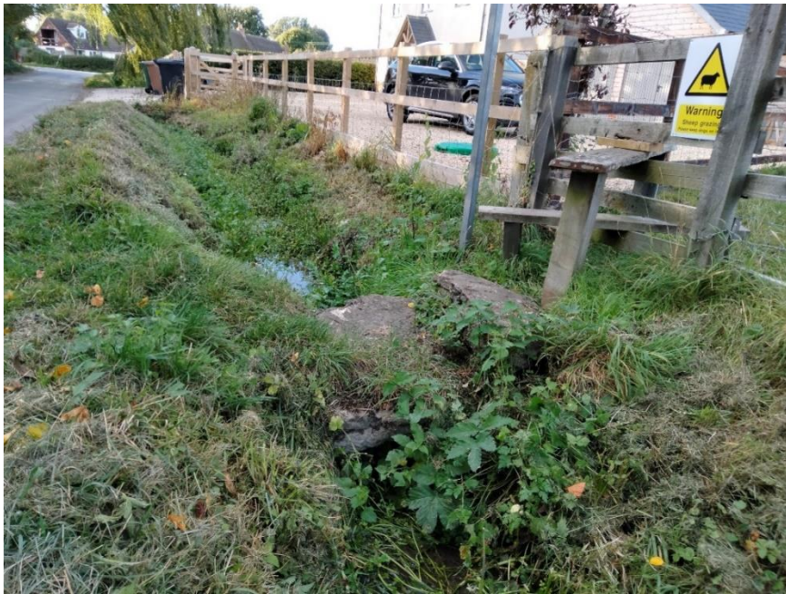
Kissing gate 3 and the repaired footbridge over the stream, onto the Woolstone Road