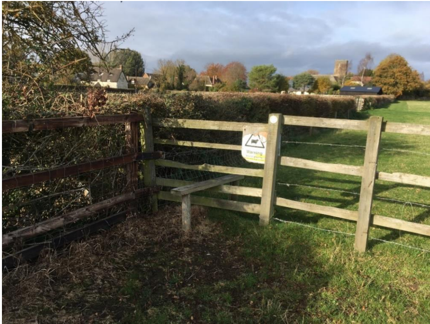
Kissing gate 2