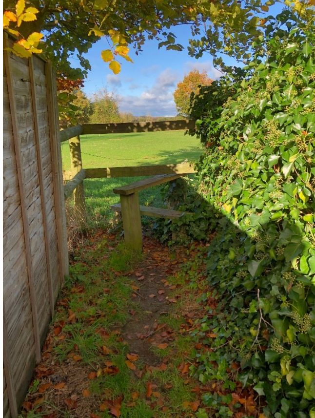
Replaced by kissing gate 1: