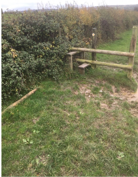
Kissing gate 6