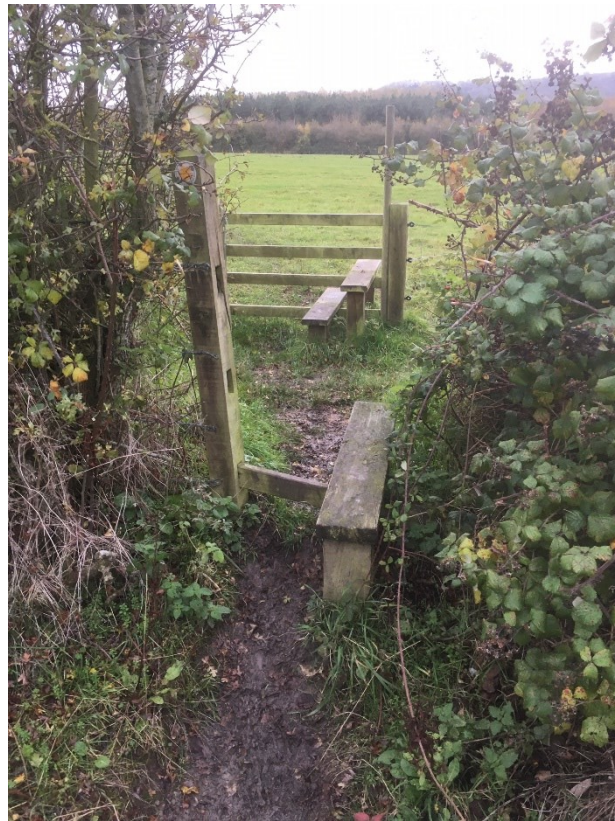
Kissing gates 8 and 9