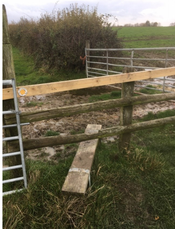
Kissing gate 7