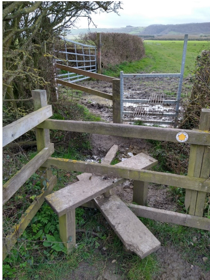
Kissing gates 4 and 5