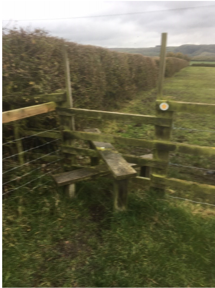
Kissing gate 3