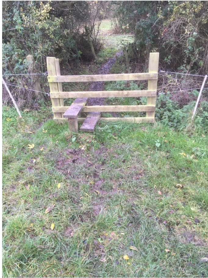
Kissing gate 10