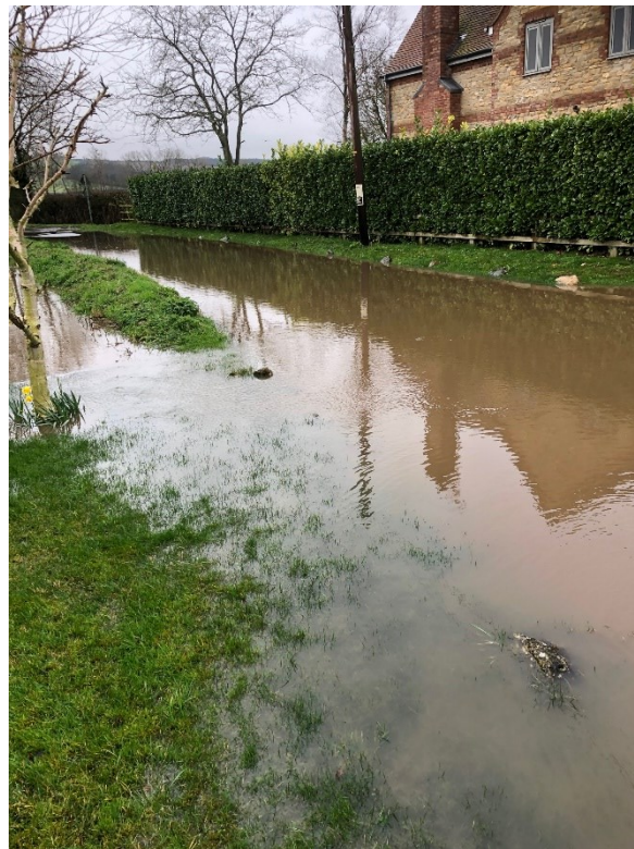
Photo 6. Flooding at Shotover on 18 February 2024 (Stonehaven on the right), showing flood water back-filling on to the road, unable to get away, as below.