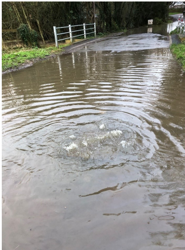
Photo 10. Hydraulic flooding from the main sewer, polluting the Uffington Brook outside Field House SN7 7RD on 18 February 2024.