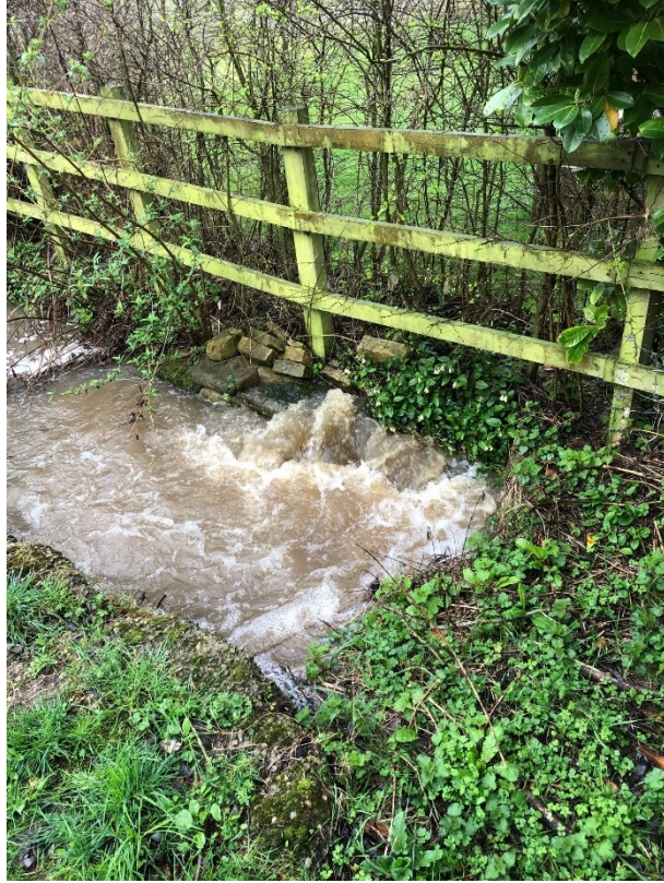
Photo 7. Entrance to the second culvert close to Stonehaven on 18 February 2024 – overloaded, and water unable to get away promptly.