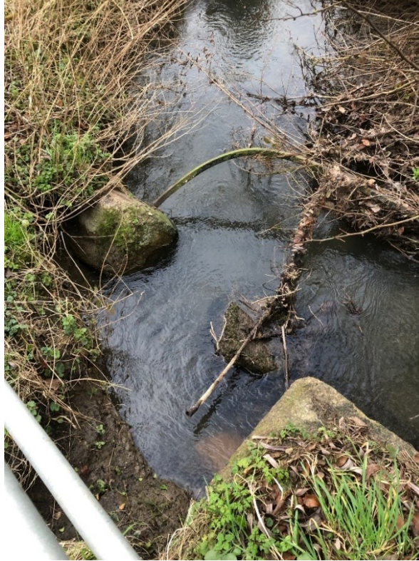
Photo 1. Broken rail and lump of concrete in Uffington Brook, at allotments, Fernham Road