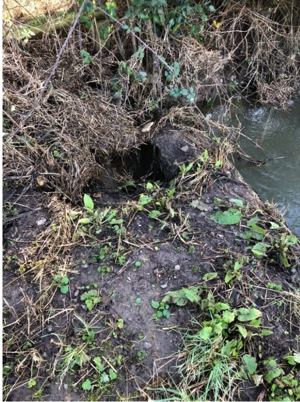
Photo 5. The second culvert under Woolstone Road – south to north – is disintegrating, on both sides of the road.