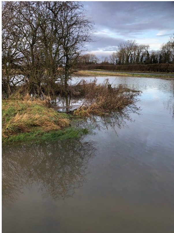
Photo 4. Flooding at the Claypit Lane / Woolstone Road 'Y' junction on 5 January 2024. (The entrance to the culvert under the road - north side to south - is in front of the tree).