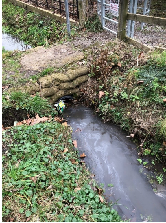
Photo 9. Pollution in the stream alongside Woolstone Road, at The Old Police House - 4 February 2024.