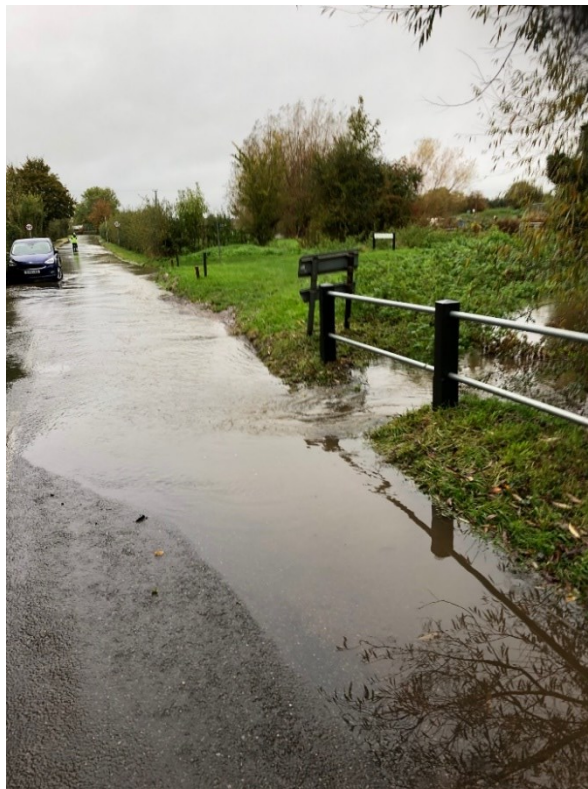
Photo 2. Damaged verge (at allotments) allows the stream to overflow onto the Fernham Road.