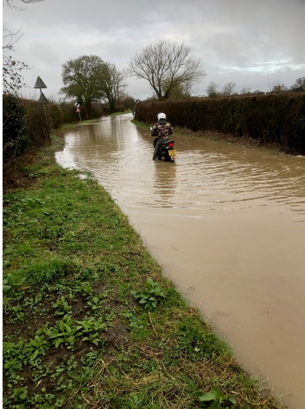
Photo 3. The Woolstone Road, flooded again on 18 February 2024