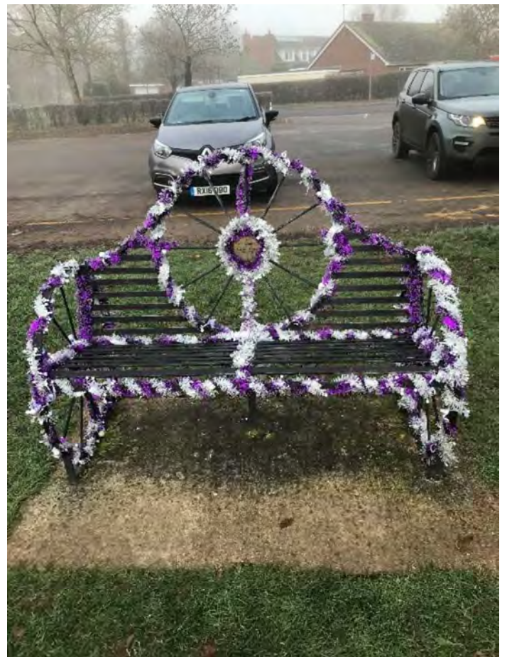
The Scrivens seat – by Angela Ritchings