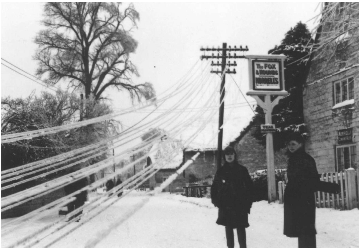
A snowy scene taken in 1936 outside the Fox & Hounds pub, Uffington

Thank you for your support and we look forward to seeing you in 2024.