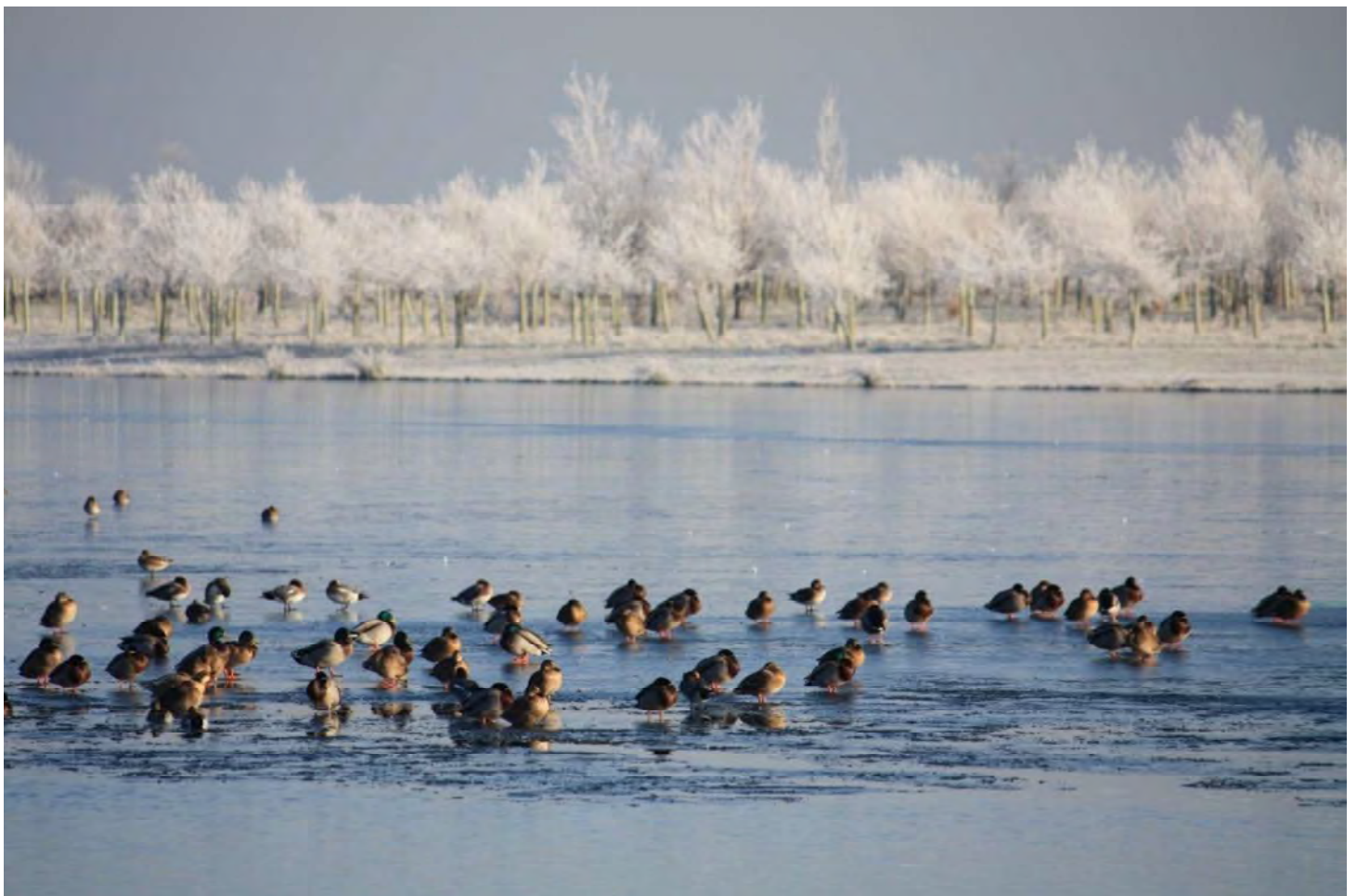
Geese on Baulking Lake