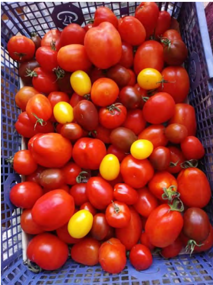
Community Garden Produce