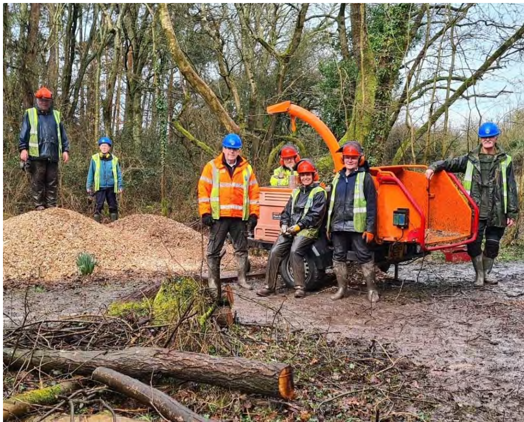
Volunteers in February around the wood-chipper at Uffington Gorse

In September, following an Uffington Gorse tree safety survey, with the help of a volunteer forestry team we managed over one weekend to fell and clear all of the dead or dying trees along the towpath and around the woods. Unfortunately, due to the high-water level, many of the trees in or across the canal were out of reach.